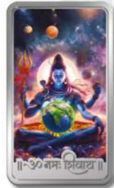
SHIV Ji COLOURED