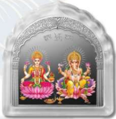
SUKH SAMRIDHI COLOURED