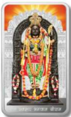
RAM LALLA COLOURED