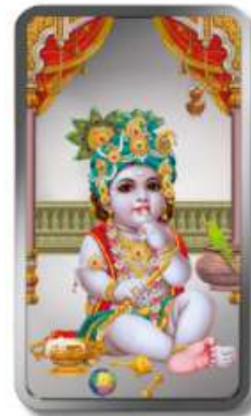
LADDU GOPAL COLOURED