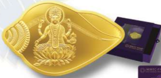
GODDESS LAKSHMI SHANKH COIN