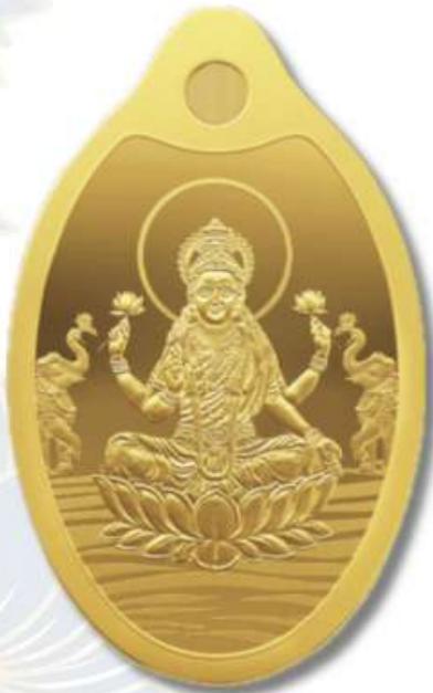
GODDESS LAKSHMI PENDANT