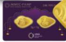
LORD GANESH SHANKH COIN